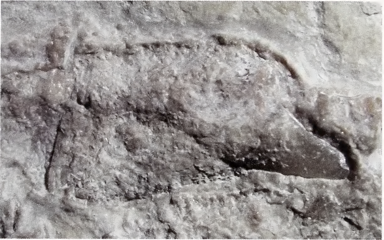
Fig. 7 – Striadiogenes frigerioi n. gen., n. sp., right chela of cheliped / chela destra del chelipede (x 8.3).